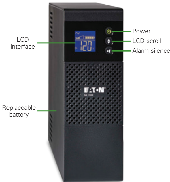
Model displayed above: 5S1500LCD