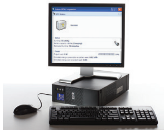
The 5S fits in small spaces and can also be used as a monitor stand.