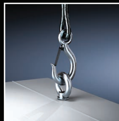
► Eye Bolt (>1.000 W)