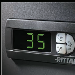
► Comfort Controller