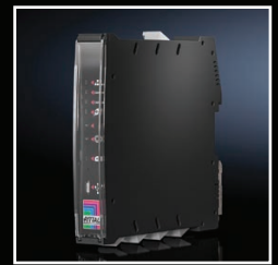
► IoT Interface compatible