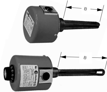
Table 1 – Screwplug Heaters (One Element) - 1" NPT