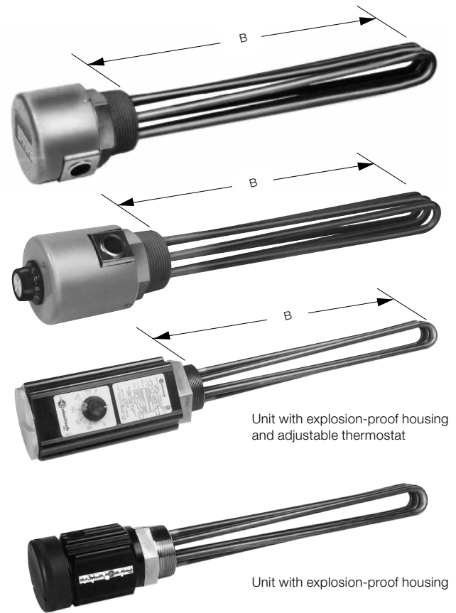
Unit with explosion-proof housing and adjustable thermostat

Standard built-in thermostat is a one pole device limited to 240V 25 amp. Whenever the heater voltage exceeds 240V or the heater current exceeds 25 amps or for three phase supply, the thermostat is intended for pilot duty only and is not factory wired to the elements. See Section F of the Caloritech™ catalog for selection of the contactor and control transformer you may require in these instances.